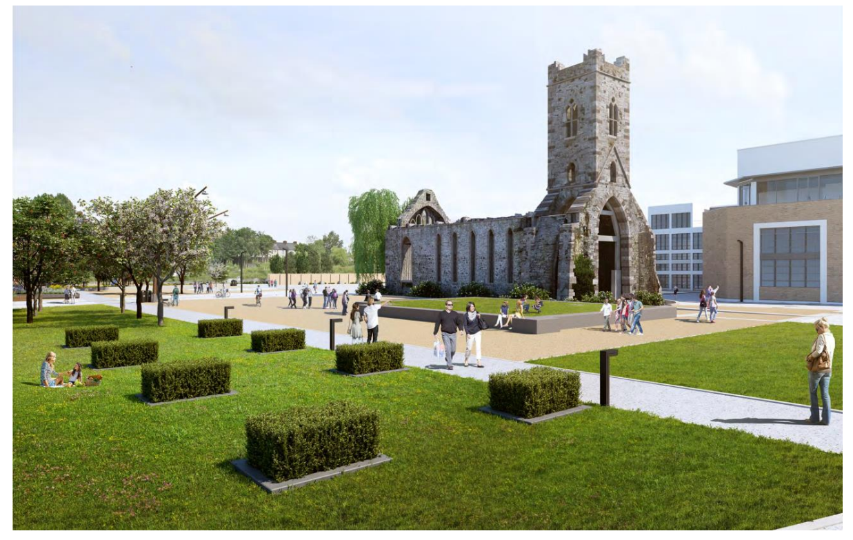
Figure 11-2: CGI of Proposed Development (Viewpoint C at year 25)

An internal view of the Site can be seen in a computer-generated image (CGI) of the proposed development shown in Figure 11-2. The image locations, additional photographs, photomontages and accurately modelled CGIs of the scheme can be seen in Appendix 11.1 of this EIAR.