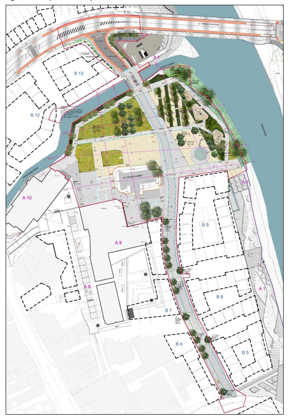
Figure 3-1: Proposed Development